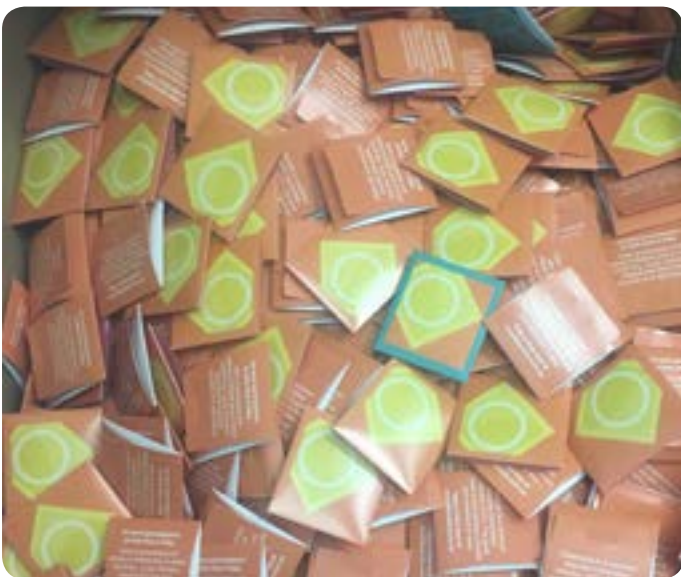
Have plenty of condoms on hand

While the main focus of this manual is on the delivery of sexual health and BBV programs through primary healthcare services, we acknowledge that people with or at risk of STIs and BBVs access a range of health services, and that their management is not confined to primary care. Hospitals have a significant role to play with regard to managing people with STIs and BBVs. In regional and remote areas, there are also different models of health service delivery that span both primary and hospital care. Hospitals may provide primary health care through outpatient clinics, and staff often provides both primary and tertiary care within those services, or they may work both in primary healthcare services and hospitals. Other services such as private general practices, the Royal Flying Doctor Service, Corrective Services health clinics and mental health services also provide primary and emergency care to people with STIs and BBVs.