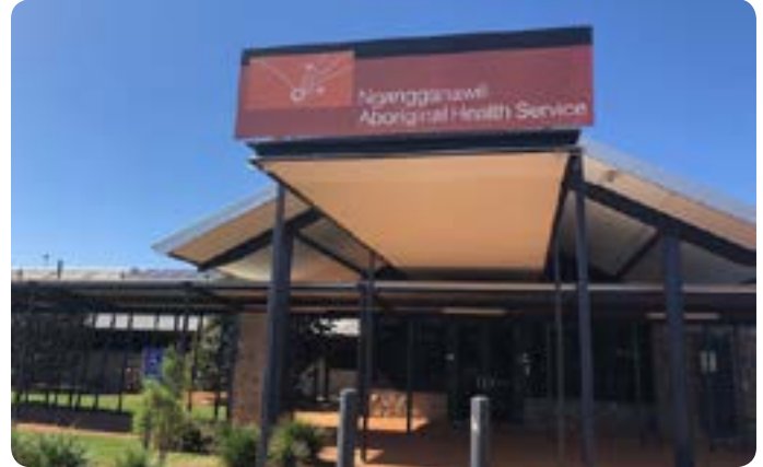
Ngangganawili Aboriginal Health Service in Wiluna